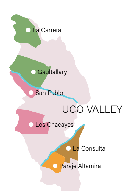
Some of Uco Valley's newly defined subregions have Geographical Indication (GI) status, others are still in the process of being officially defined.

fuller-bodied with dark fruit and herbs; Malbec—by far the district's star grape—shows power and concentration with fresh acidity. Zuccardi's Poligonos Altamira, one in a series of single vineyard Malbecs made in different districts, illustrates Altamira's unique underlying salinity. "The calcareous soils here force vines deeper and add structure, which the Malbec variety can often lack," Zuccardi explains.